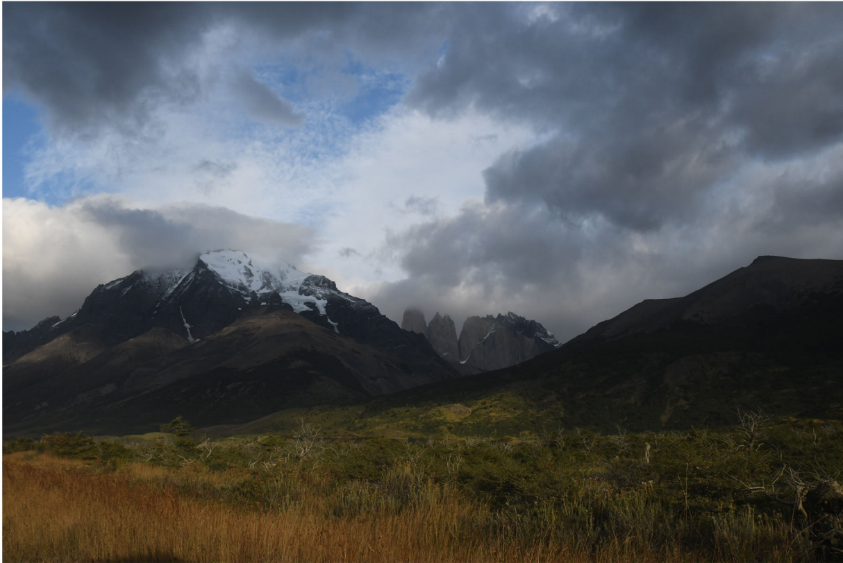
After the Storm