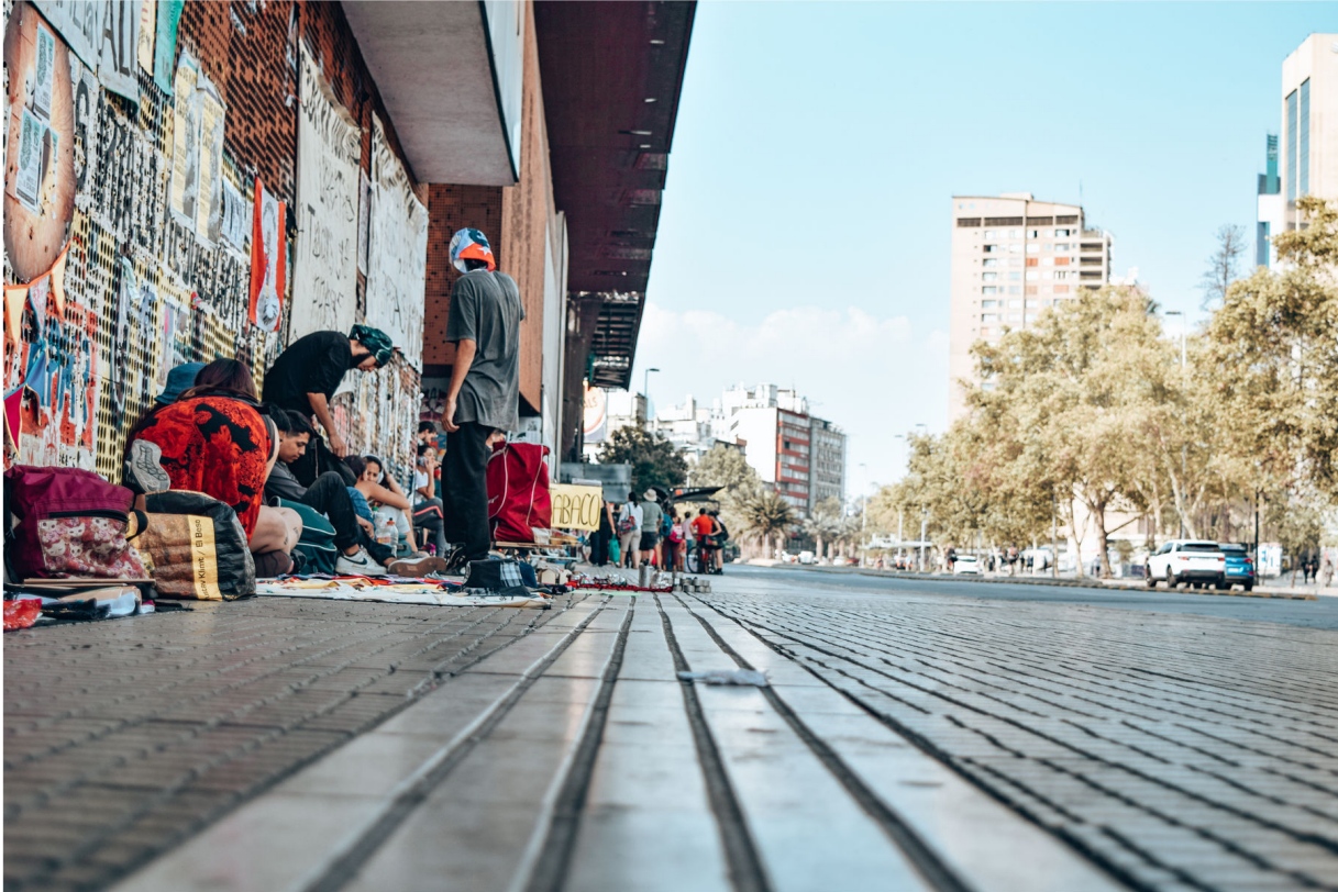
A place divided, con las comunidades unidas.