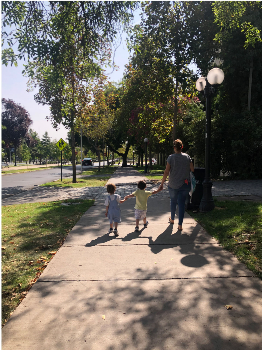
On the Way Home