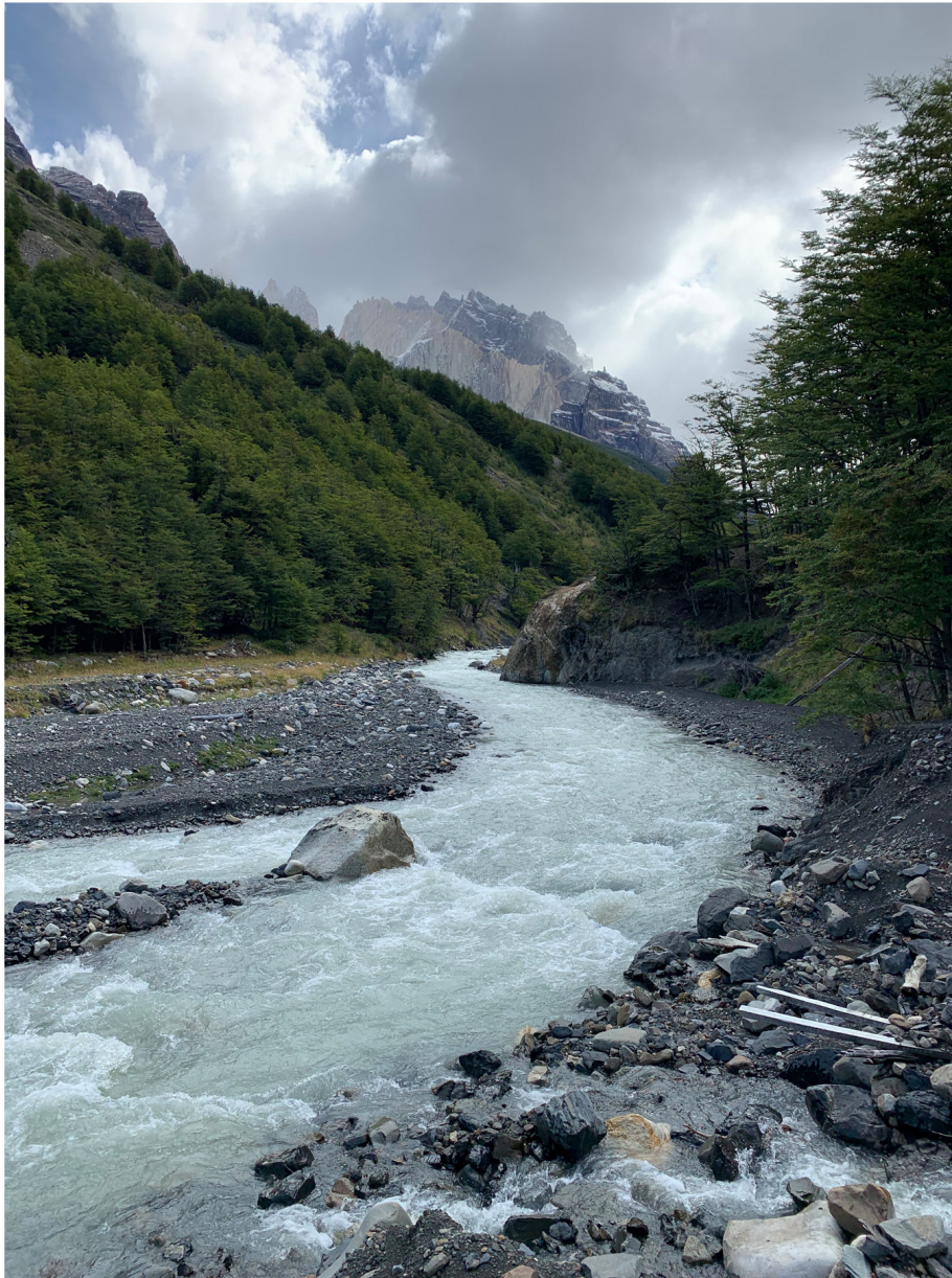
Icy Blue dividing Vast Green