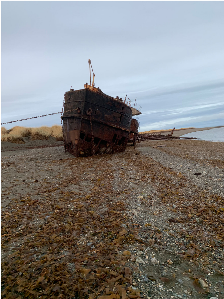
Rusted and Busted