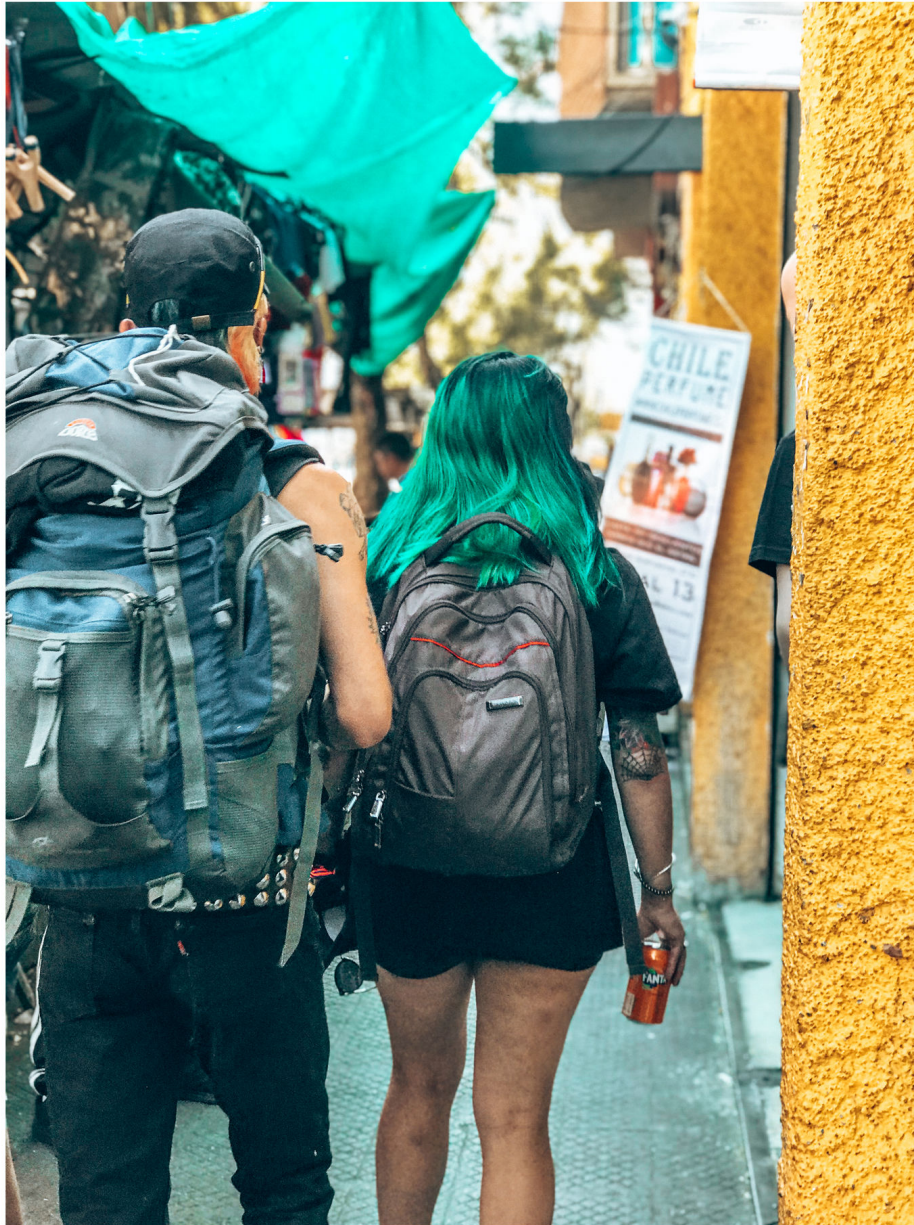
Life in colour, las calles de Santiago.