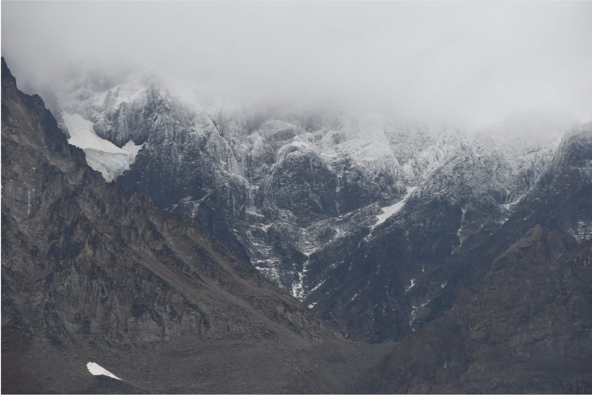
A Dusted Cliff Exposition