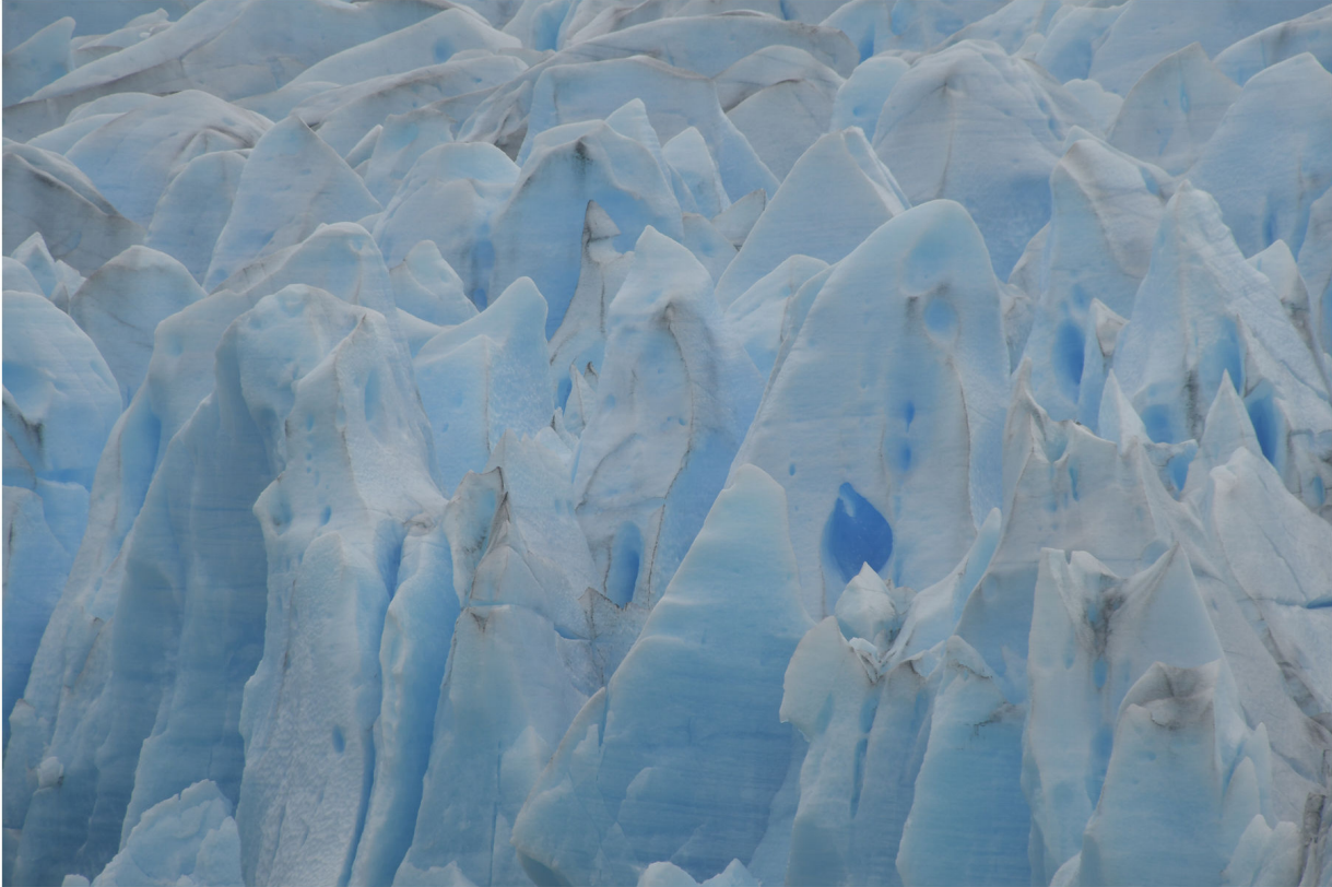
The Tipping Point