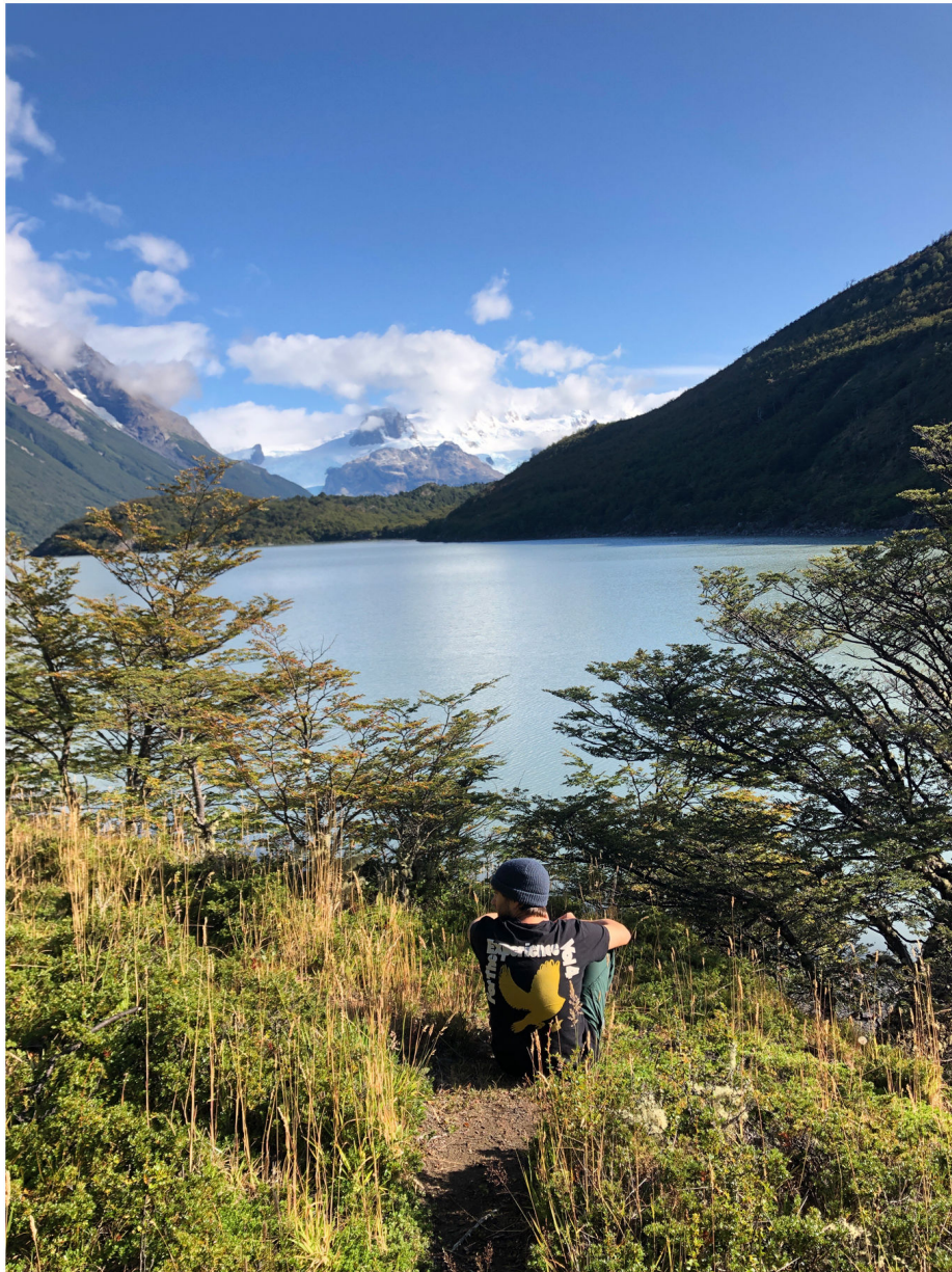
simple morning pt. 1