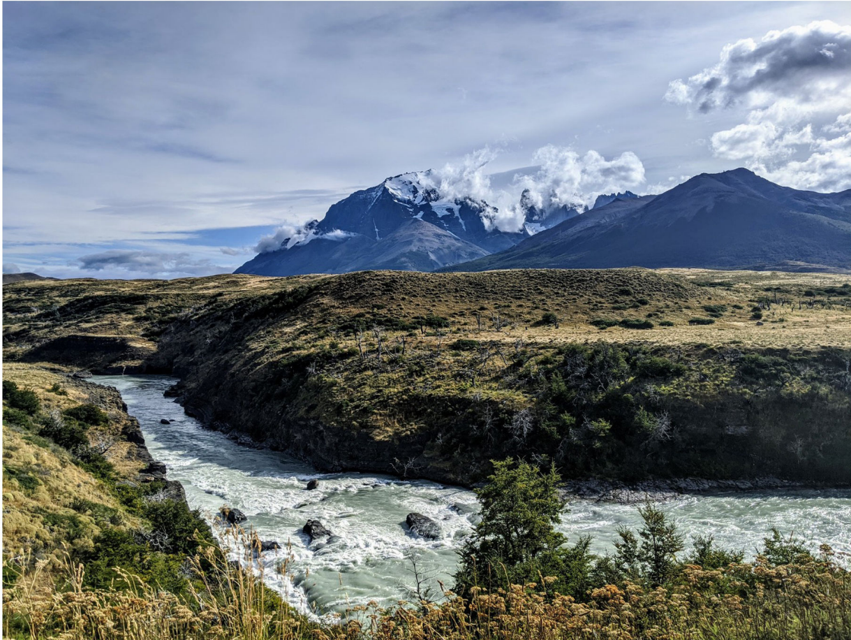
Montañas y valles, giros y vueltas