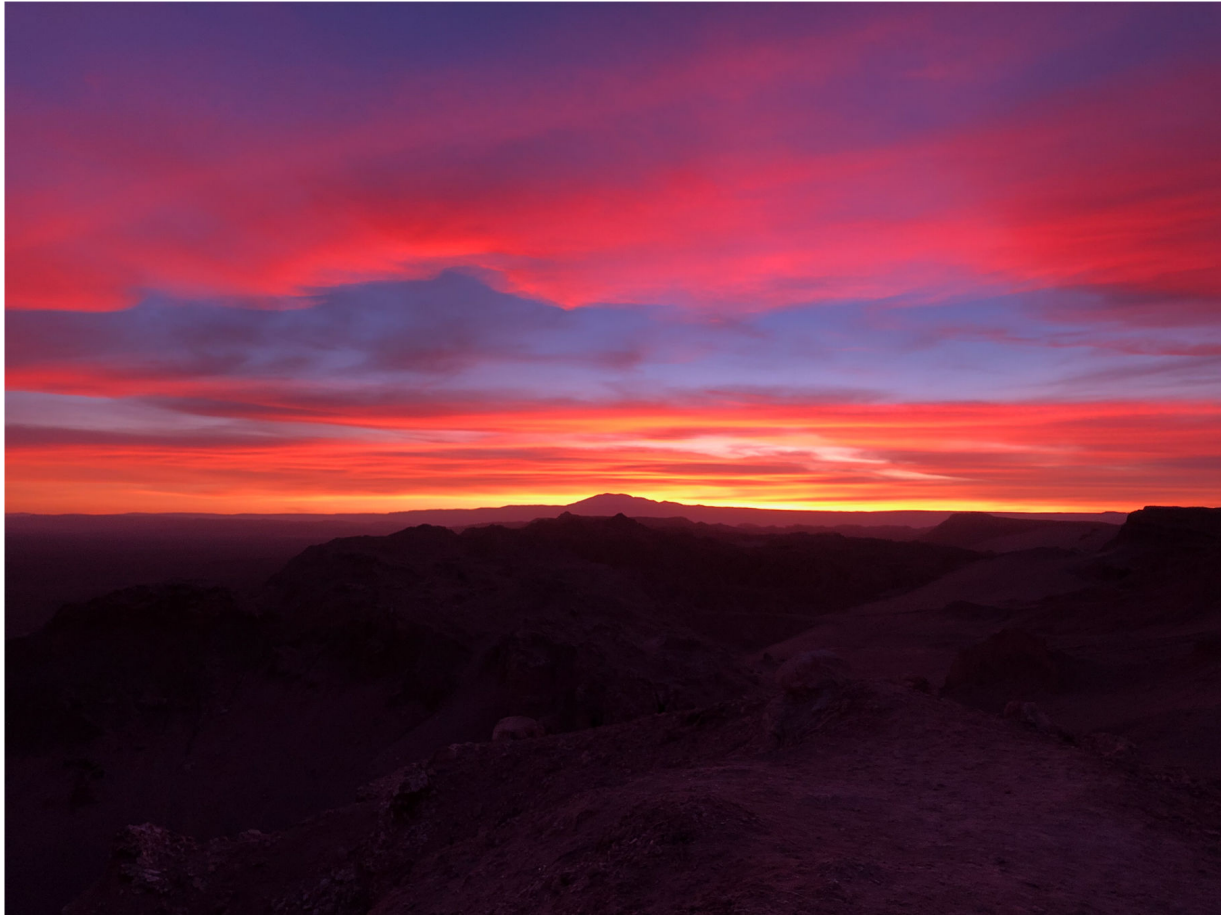
Being in colors