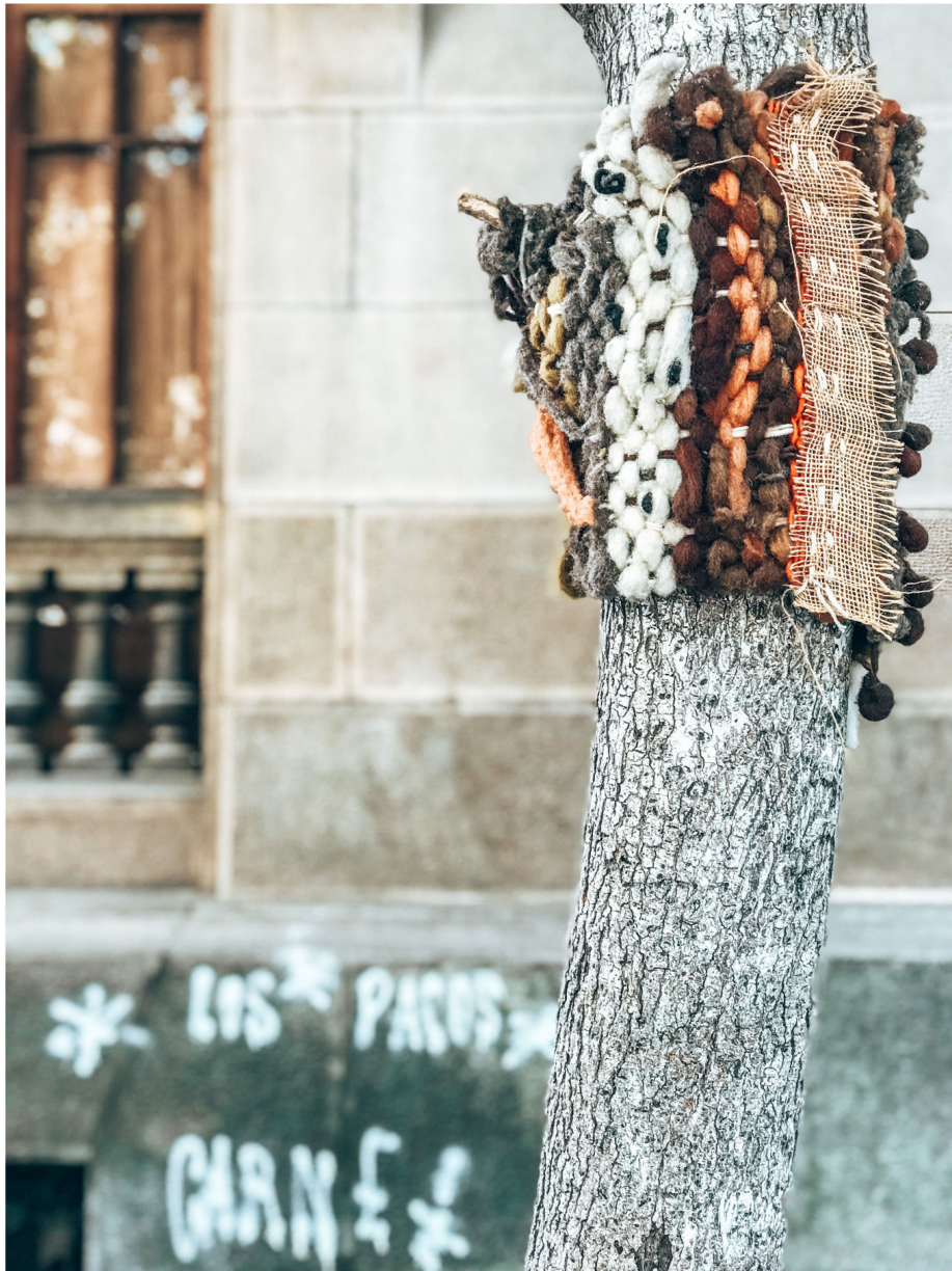
La tradición y la realidad, the change of a society.