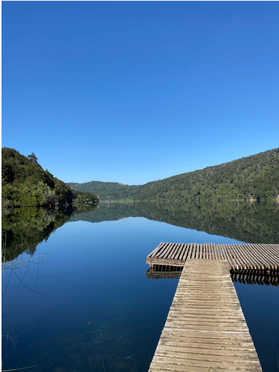
Recognizing the pace