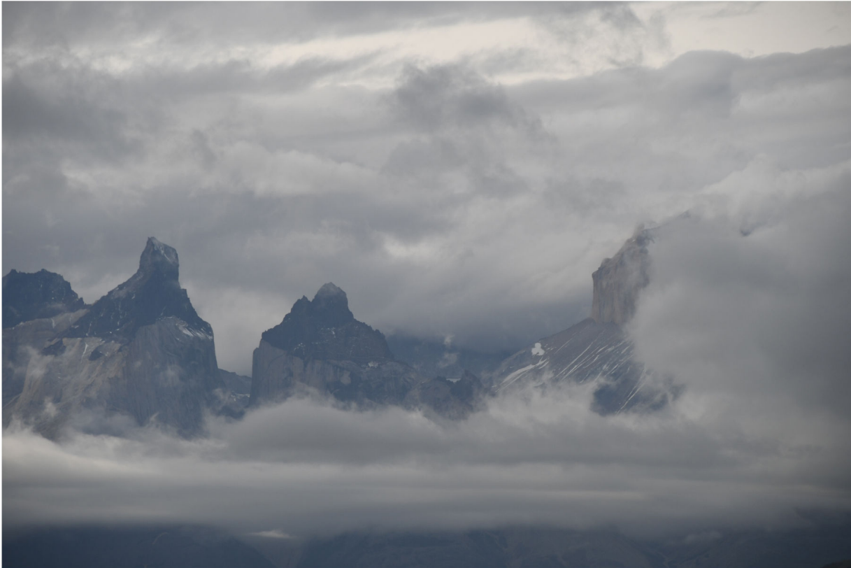
A World Above