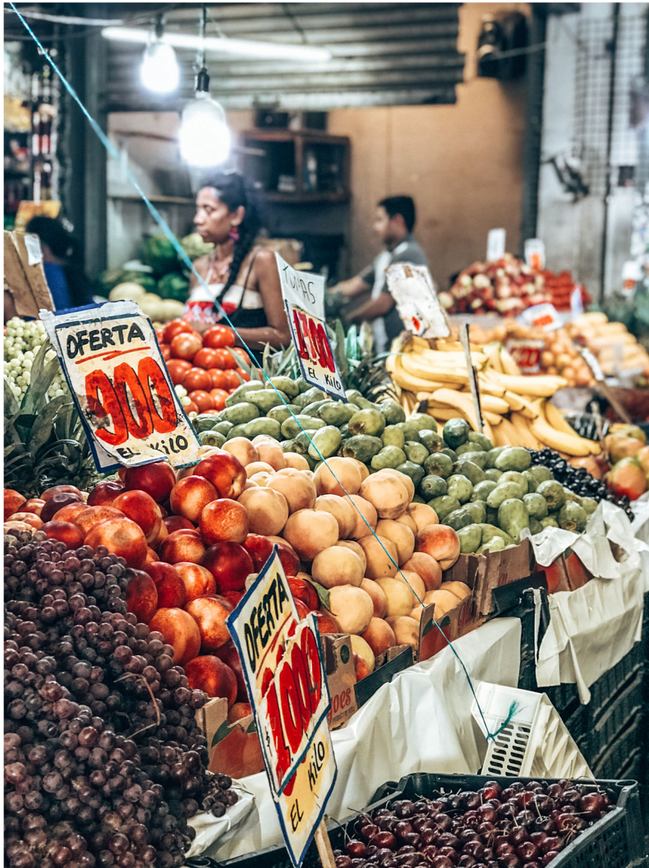
Local produce, para sostener la vida saludable.