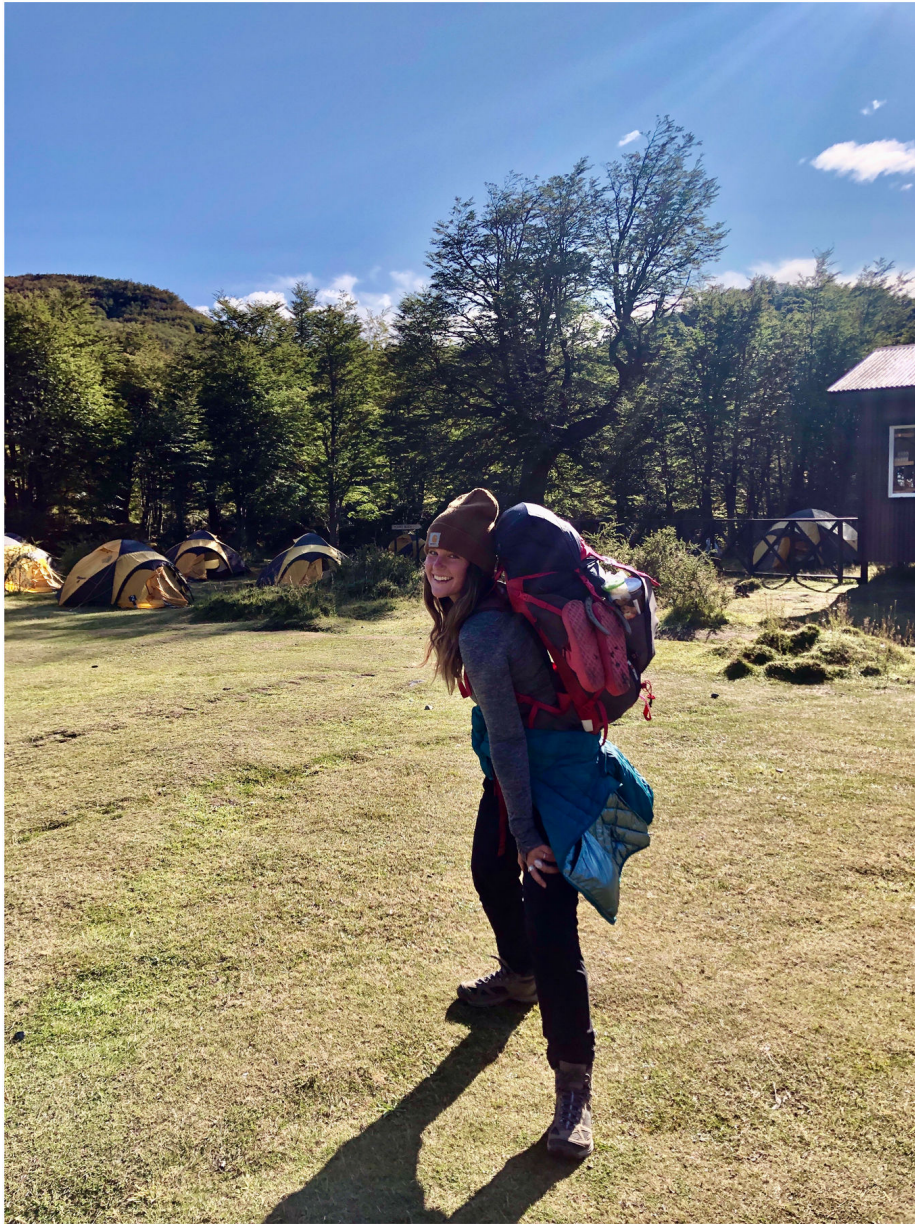
simple morning pt. 2