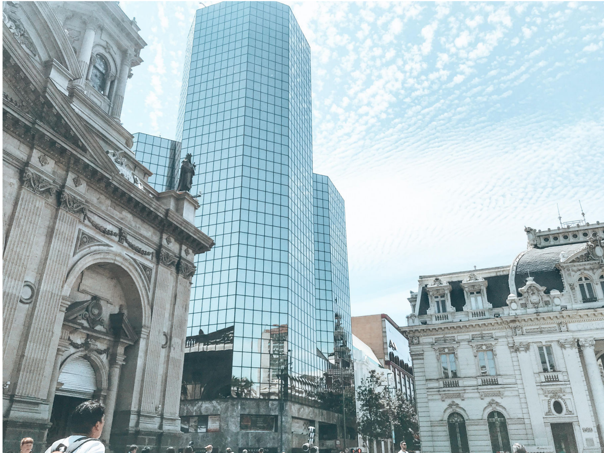
La ciudad vieja y moderna, to walk the streets.