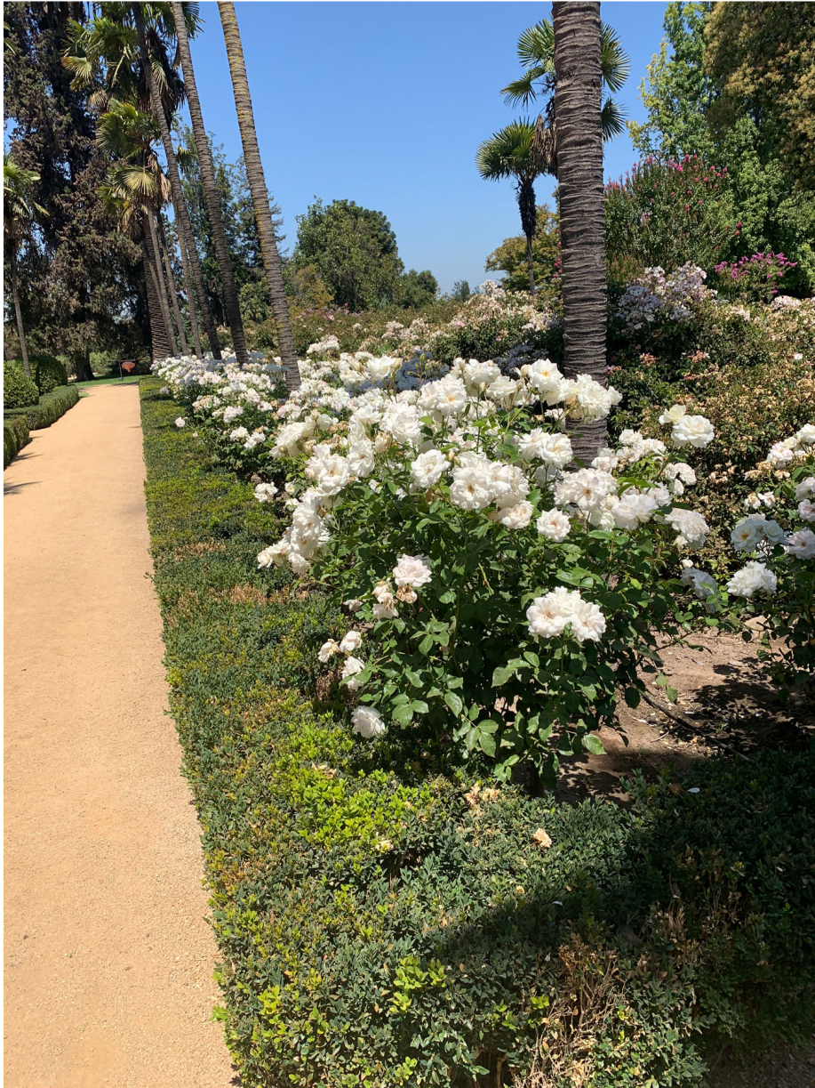
Snow in a Warm Place