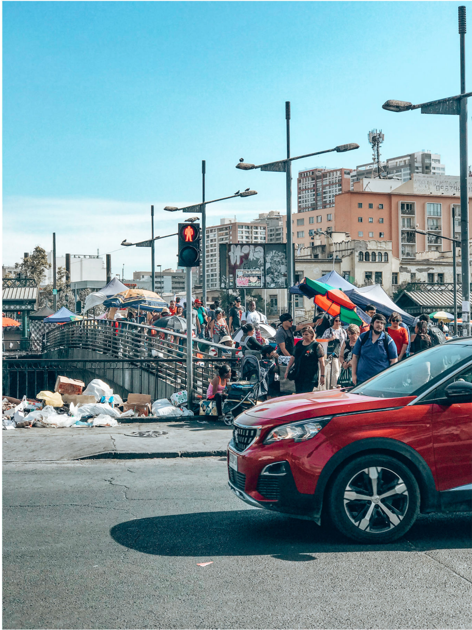
The real heart of the city, el Mercado central.